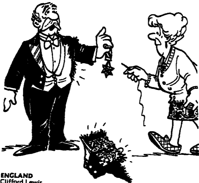
ENGLAND Clifford Lewis

"They don't make formal clothes like they used to!"